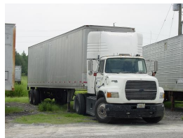
Our drivers will pick-up your waste tires between 24—48 hours of your call.

Although we offer convenient pickup of waste tires with our fleet of route trucks, the most cost-efficient manner is our trailer drop program where we will spot a 45' trailer on the customer's business site.