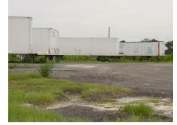
Plenty of trailers to meet your tire disposal needs with our trailer-drop program.

Some customers have converted to the trailer drop program and have cut their tire disposal expense by almost half. We are presently working on a land clean-up program.